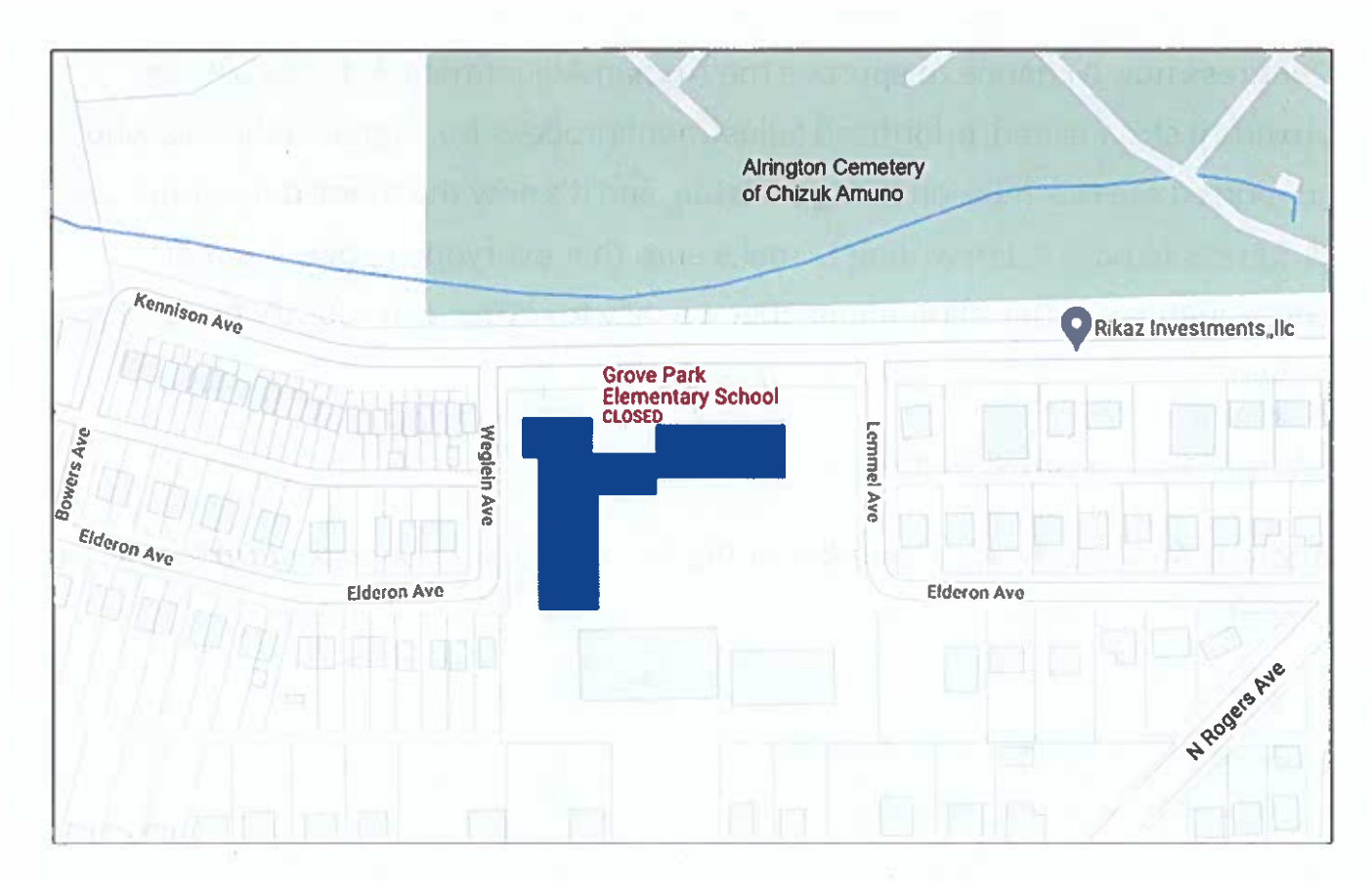
Neighbors say saving the Grove Park Elementary School building in Baltimore would benefit the community.

In 2020 and 2021, the Grove Park Improvement Association worked with charter school organizations to reopen Grove Park Elementary School. But every proposal we submitted was rejected by Baltimore City Public Schools.