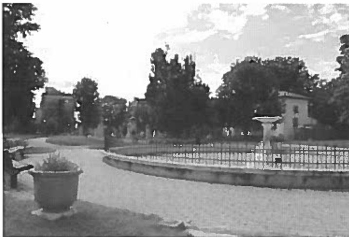
Image 5 – Marble Fountain, Superintendent's House, and Entrance Gates