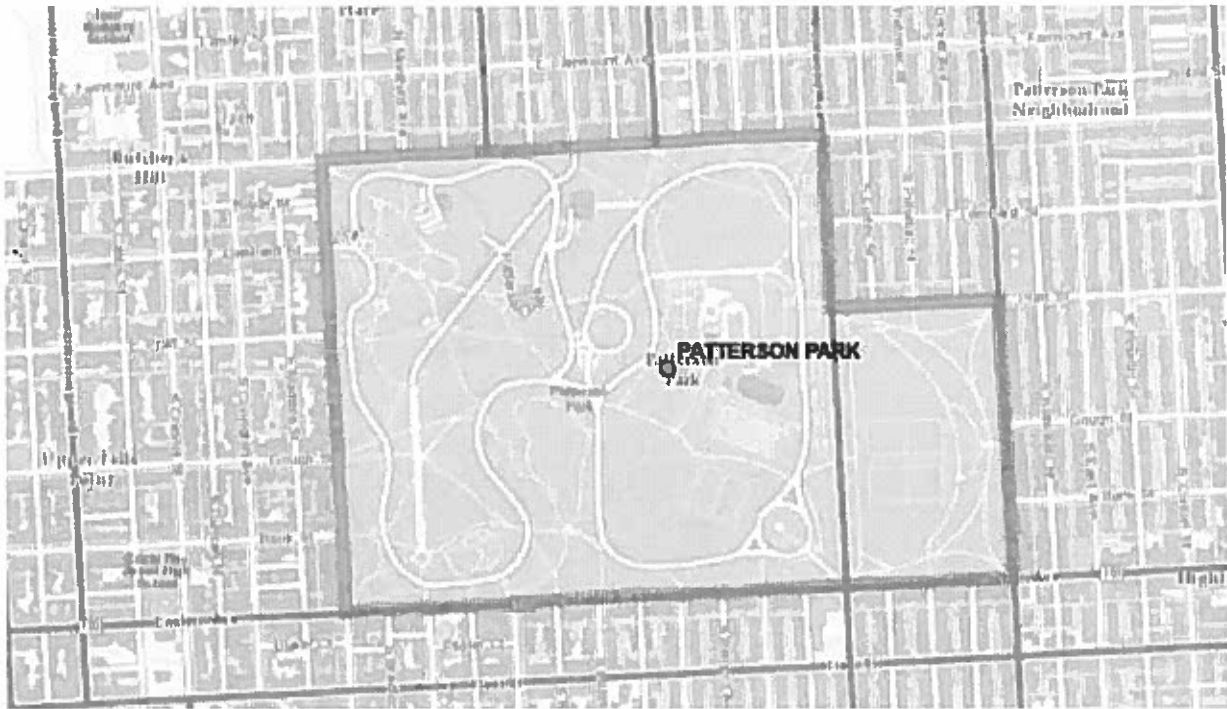
Map 1: Google map of the property.