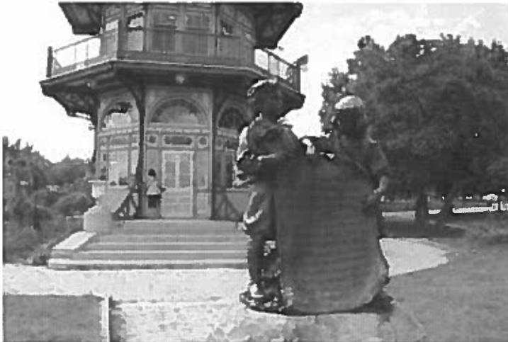
Image 4 – Centennial War of 1812 Monument in the foreground of Patterson Park Pagoda (Baltimore City Landmark)