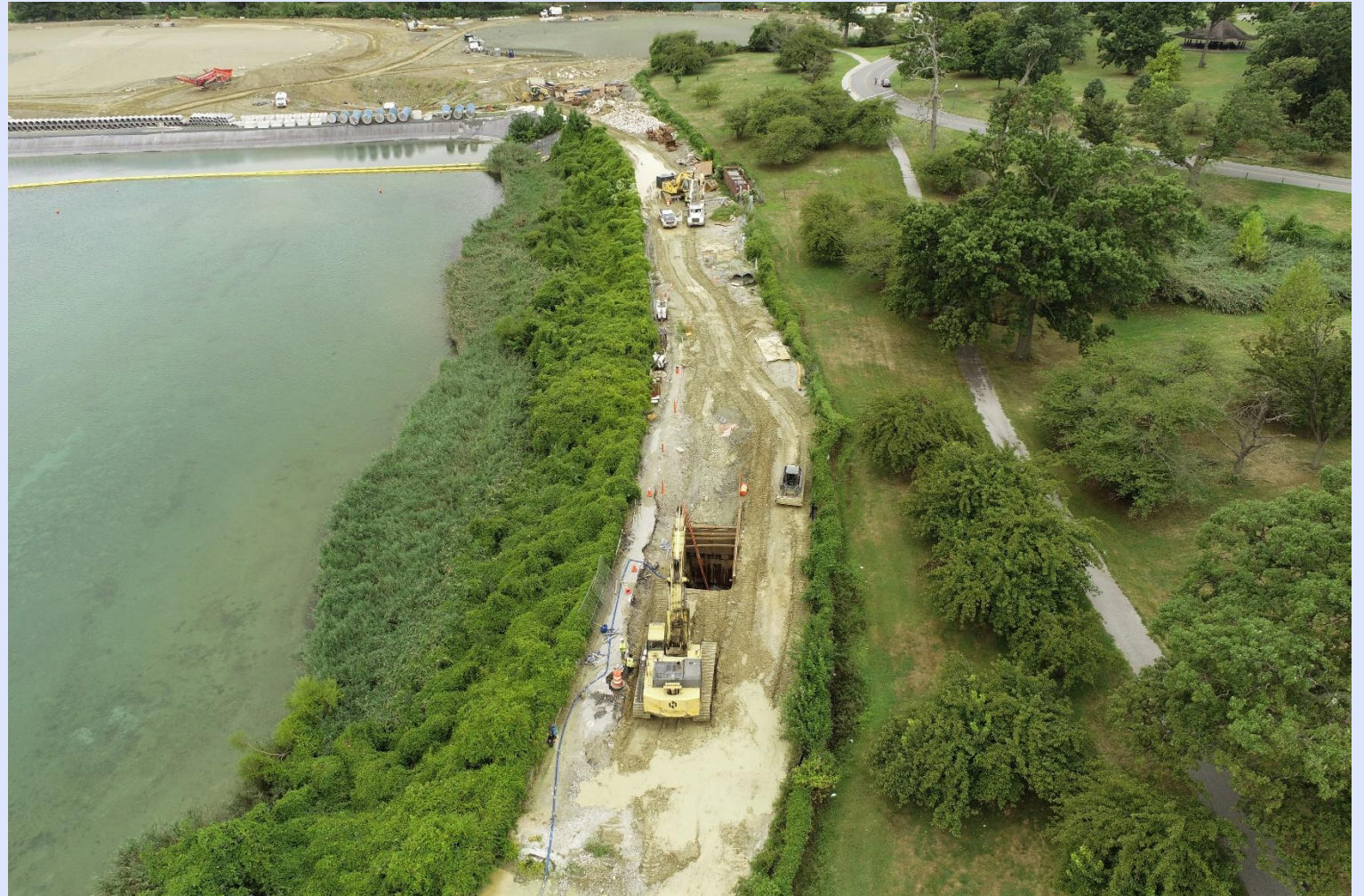
Alignment "A" – 72" pipe installation – 9/7/2022