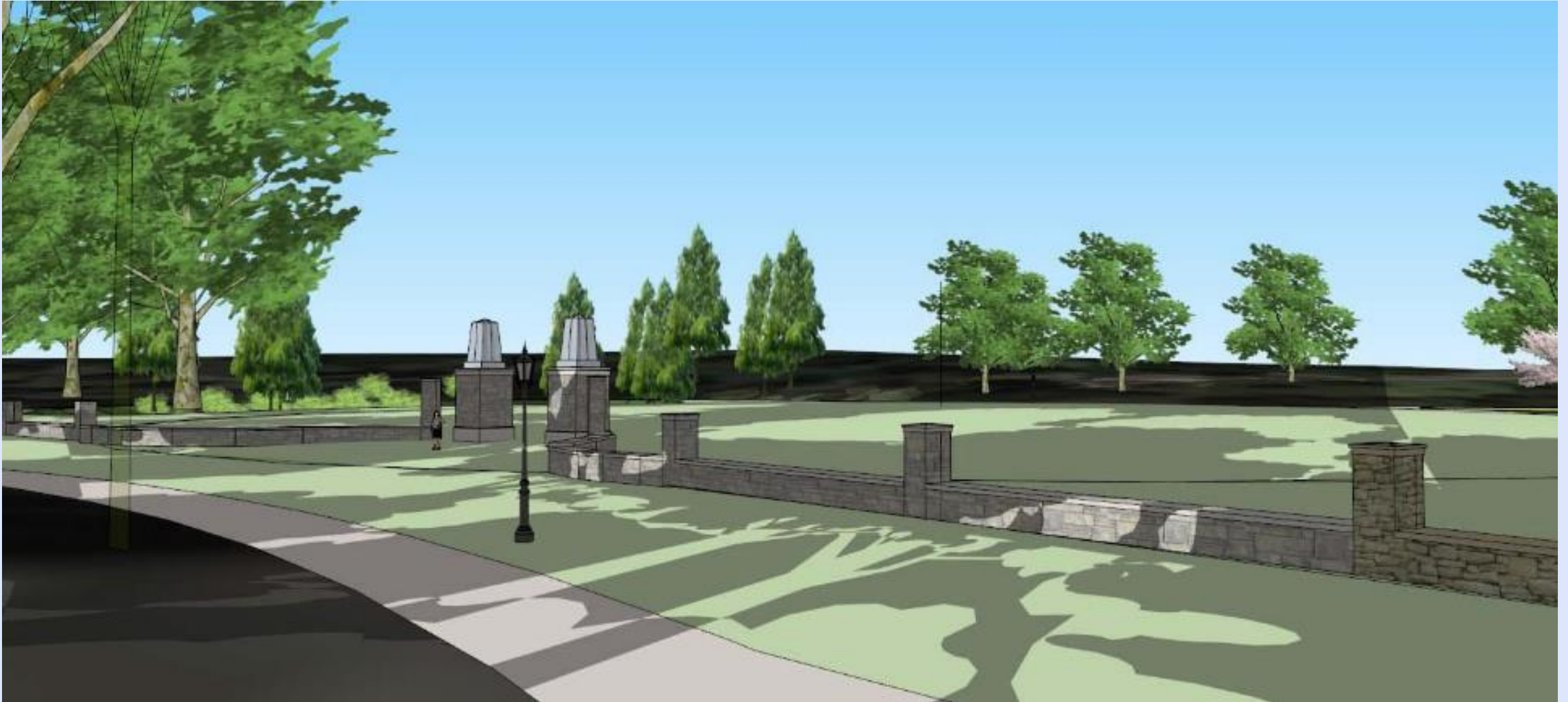
New Landscaping, Lighting, Paths and Walls