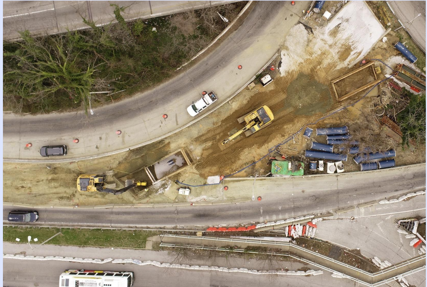
Installation of 30” water line (aerial view) – 3/23/2022