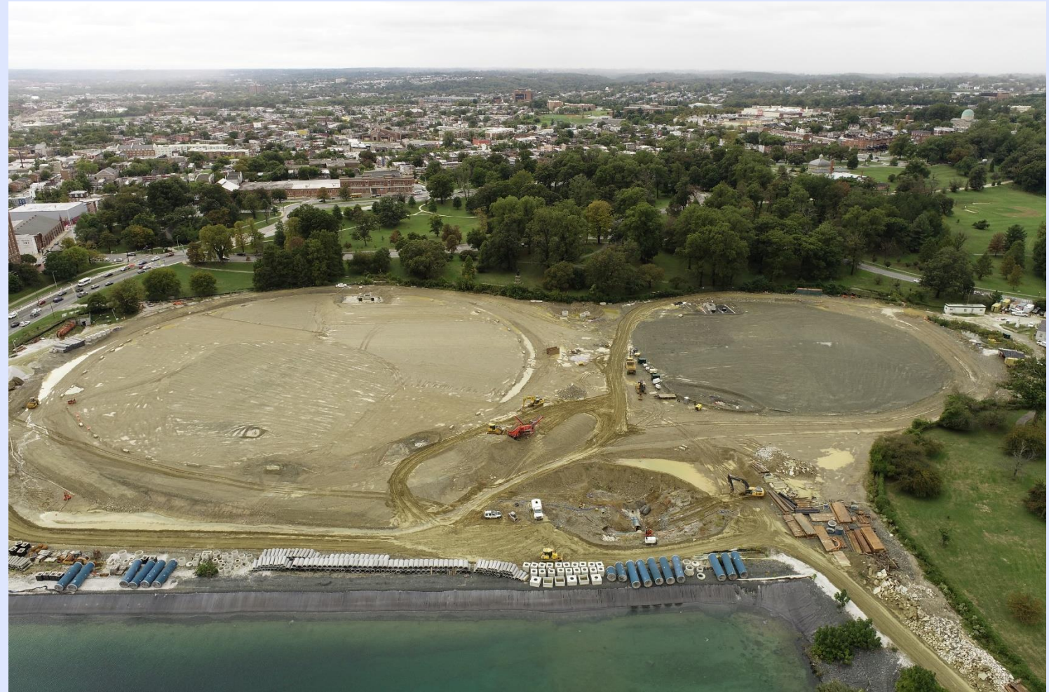
Tank 1 & 2 with backfill (aerial view) – 10/5/2022