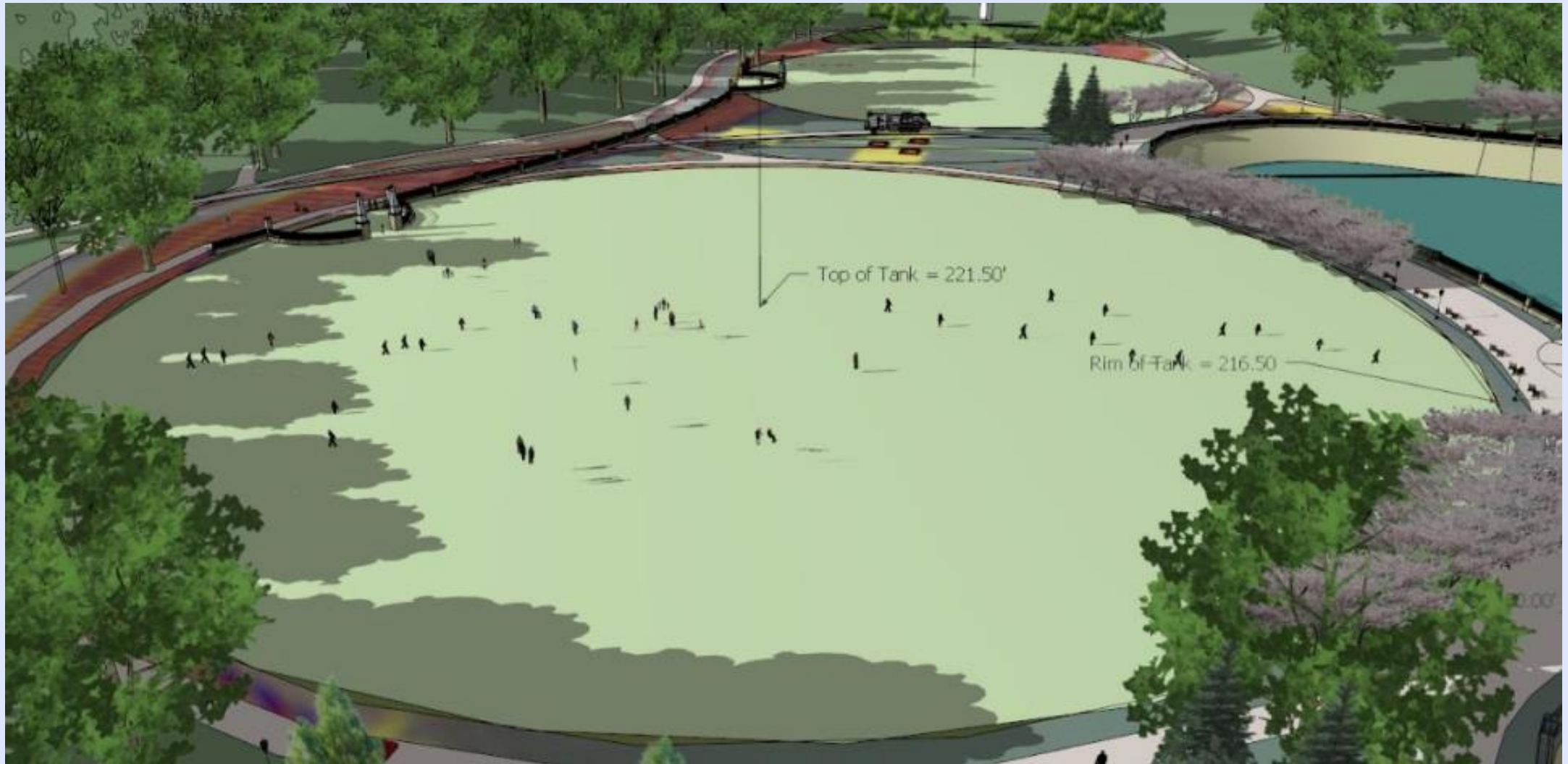
New Open Park Space atop Tanks