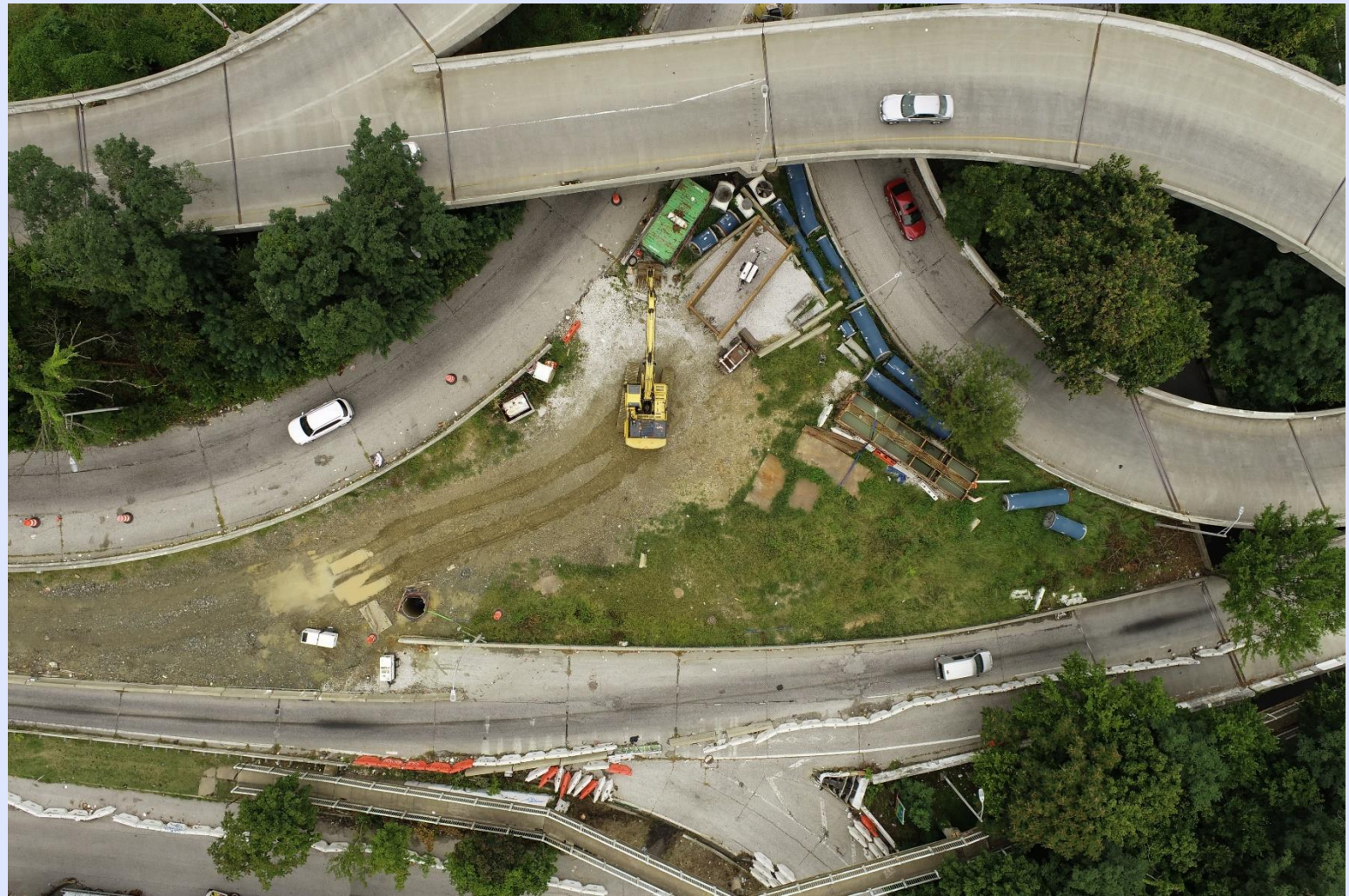
Location of water main tie-ins (aerial view) – 9/7/2022