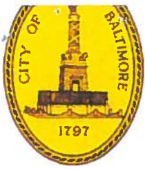
Catherine Pugh Mayor