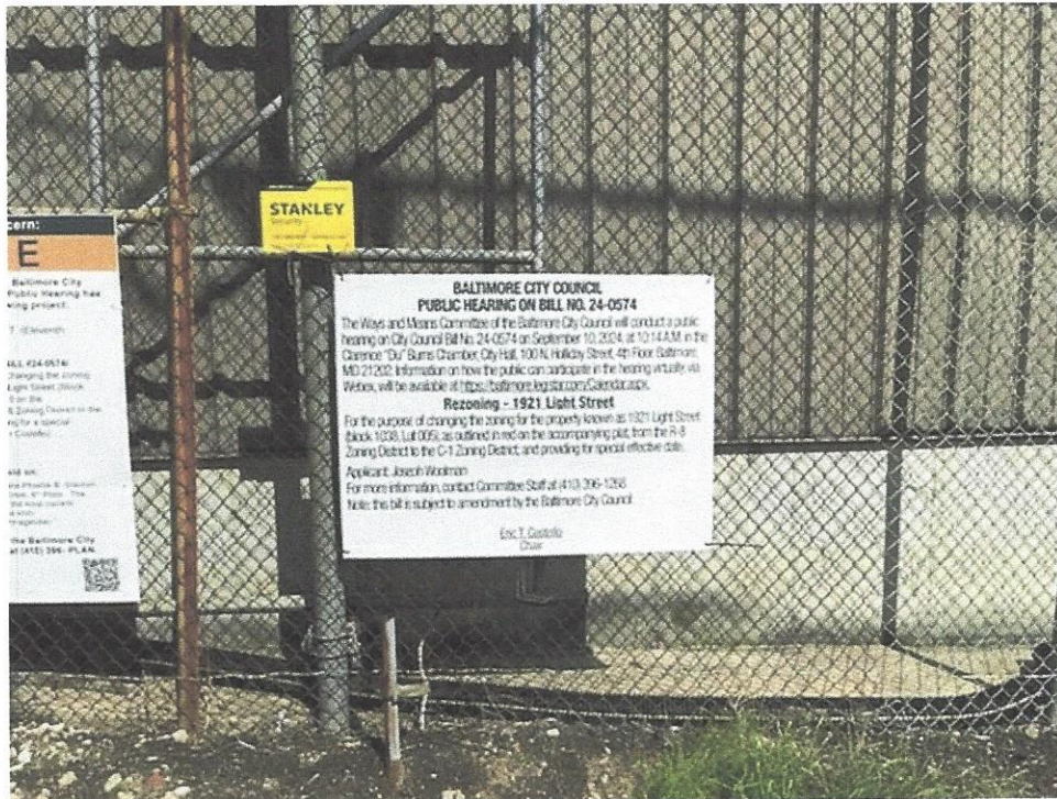
1921 Light Street – front of property mid-block (1 of 3)

I HEREBY CERTIFY, under penalty of perjury, that 2 signs were posted at: