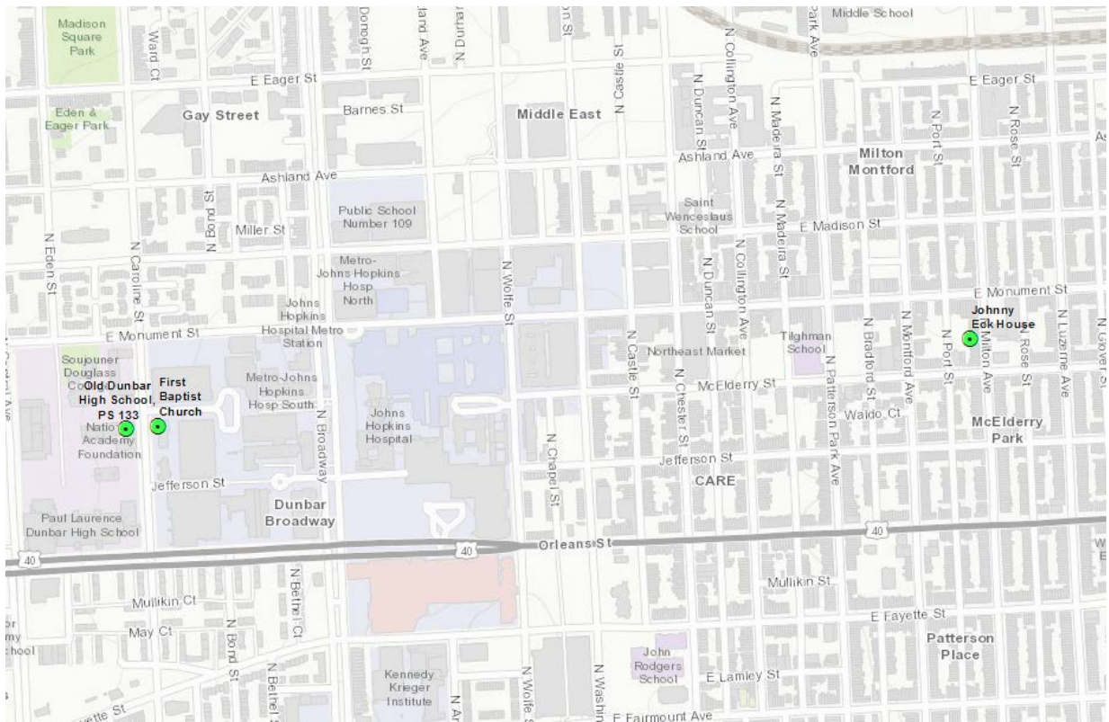
Baltimore City Landmarks in area