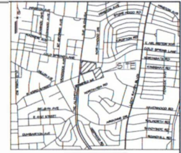
VICINITY MAP SCALE: 1" = 100'