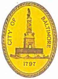
Catherine Pugh Mayor