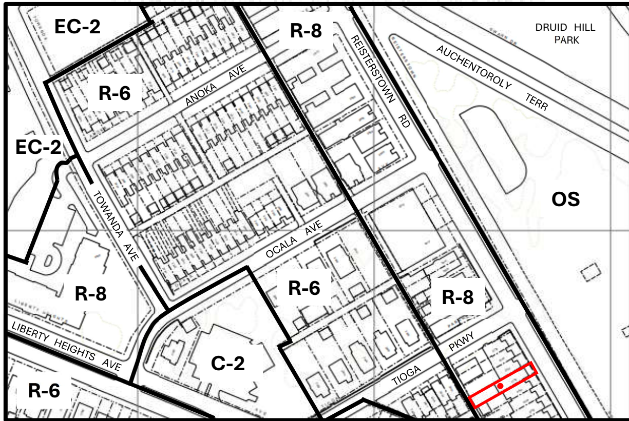
Scale: 1" = 200'