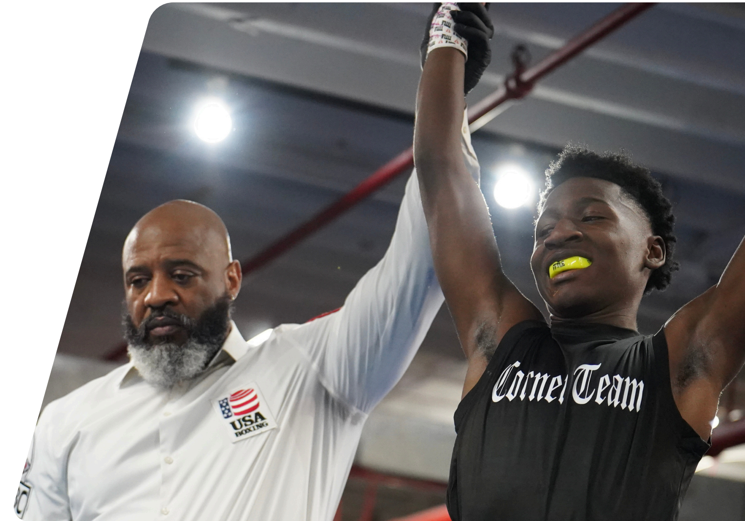
Corner Team - BCYF Grantee Partner