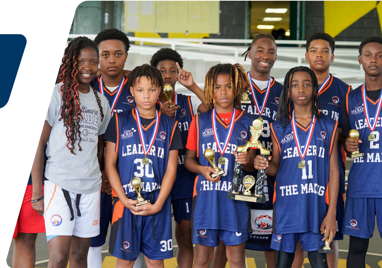
Leader Breeders, Inc. - BCYF Grantee Partner

“Together, we can ensure every middle schooler in Baltimore has the right, the space, and the support to play.”