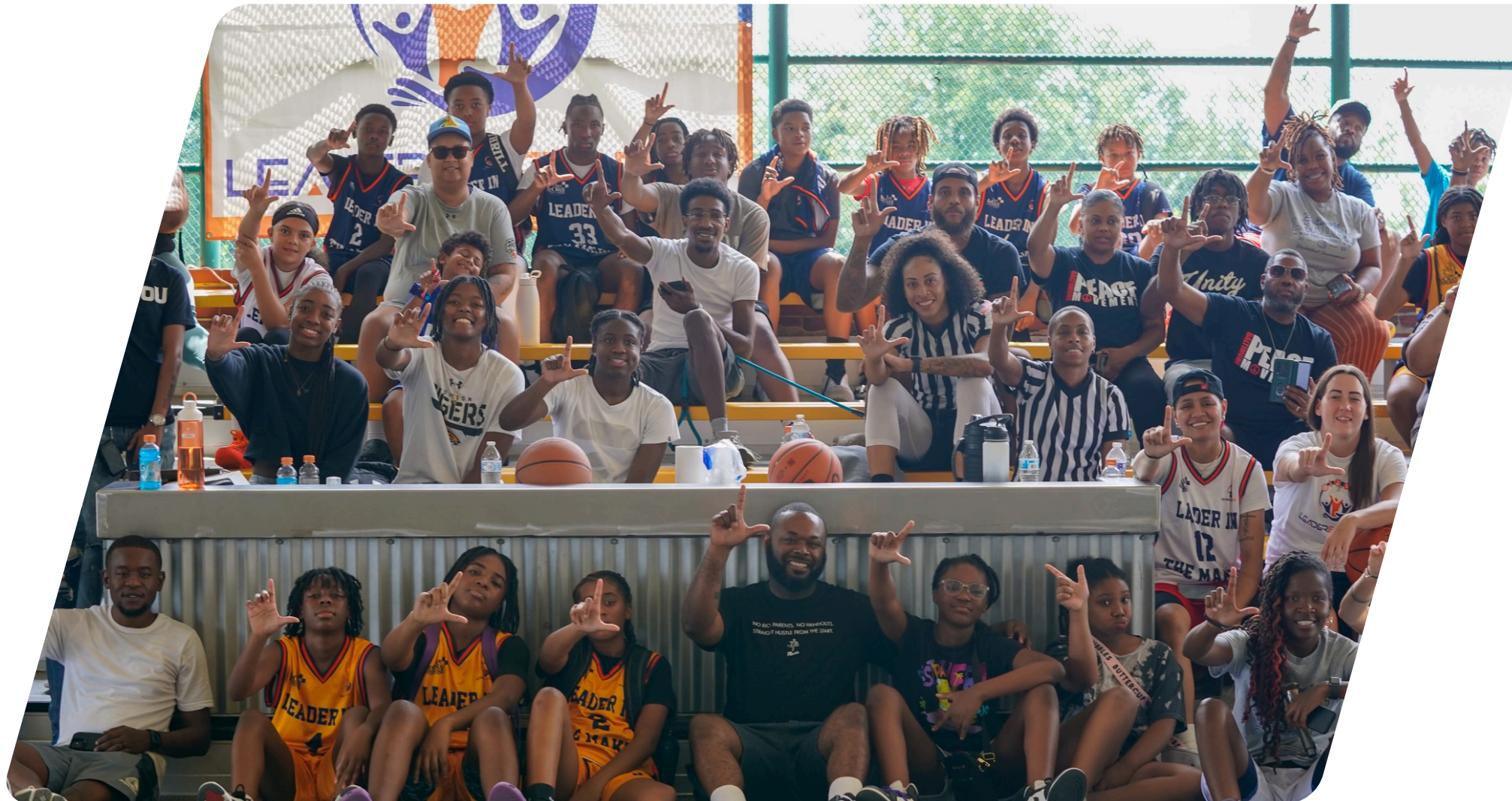
Leader Breeders, Inc. - BCYF Grantee Partner