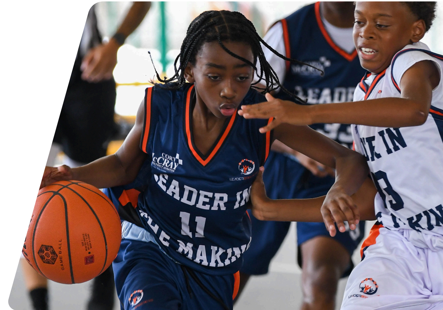
Leader Breeders, Inc. - BCYF Grantee Partner