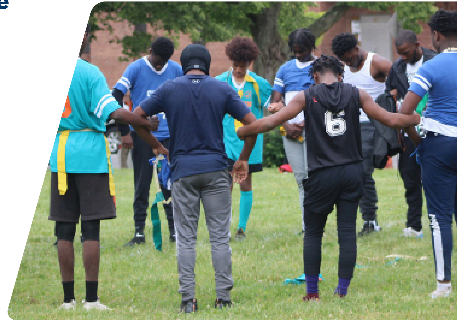
10:12 Sports - BCYF Grantee Partner