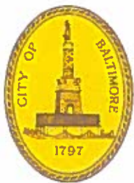
Catherine Pugh Mayor