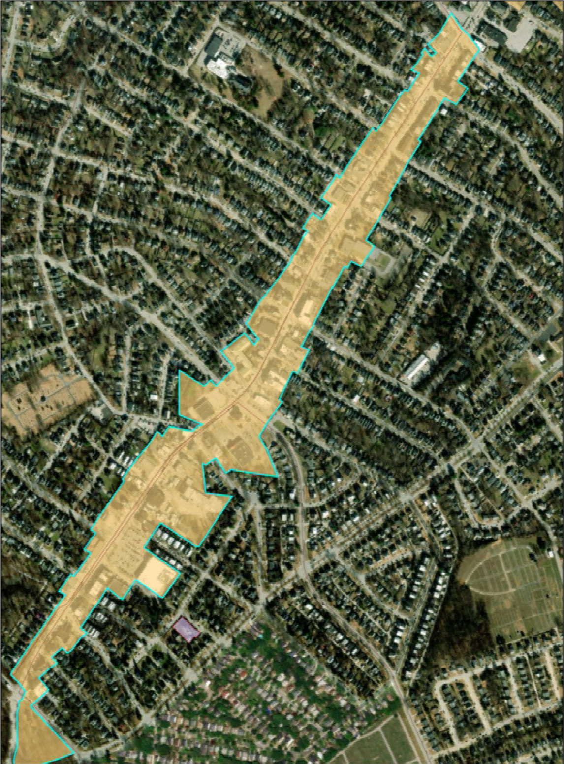
Aerial view of the Key Highway Urban Renewal Plan Area (Orange), Historic Landmarks (Purple with red outline), and National Register Historic Districts (Red Outline)