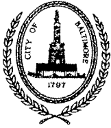
Sheila Dixon Mayor