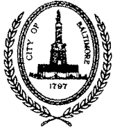
Sheila Dixon Mayor