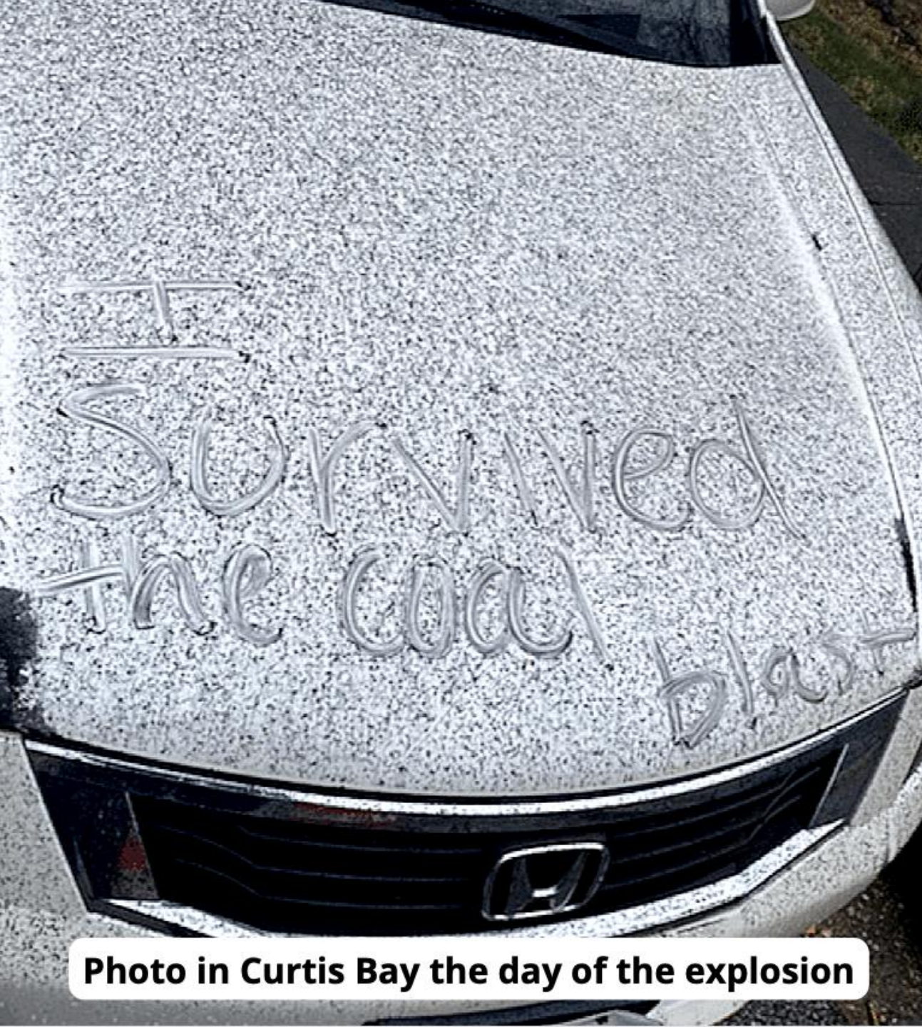
Photo in Curtis Bay the day of the explosion

"You've got coal dust all along the outside window sills and even on the inside of your window, where it comes through the screens. It's nasty."