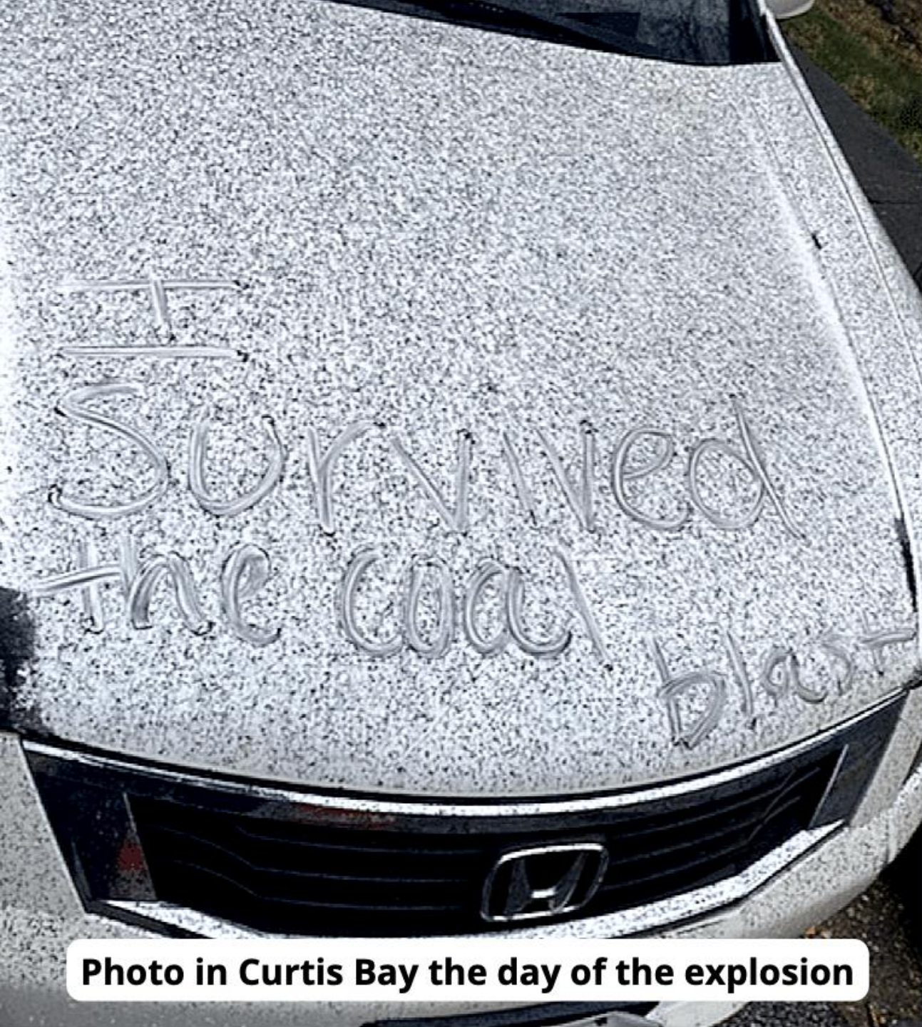
Photo in Curtis Bay the day of the explosion

"That was one nasty explosion, it was almost like a hydrogen bomb went off. It actually shook the houses here on Church Street."