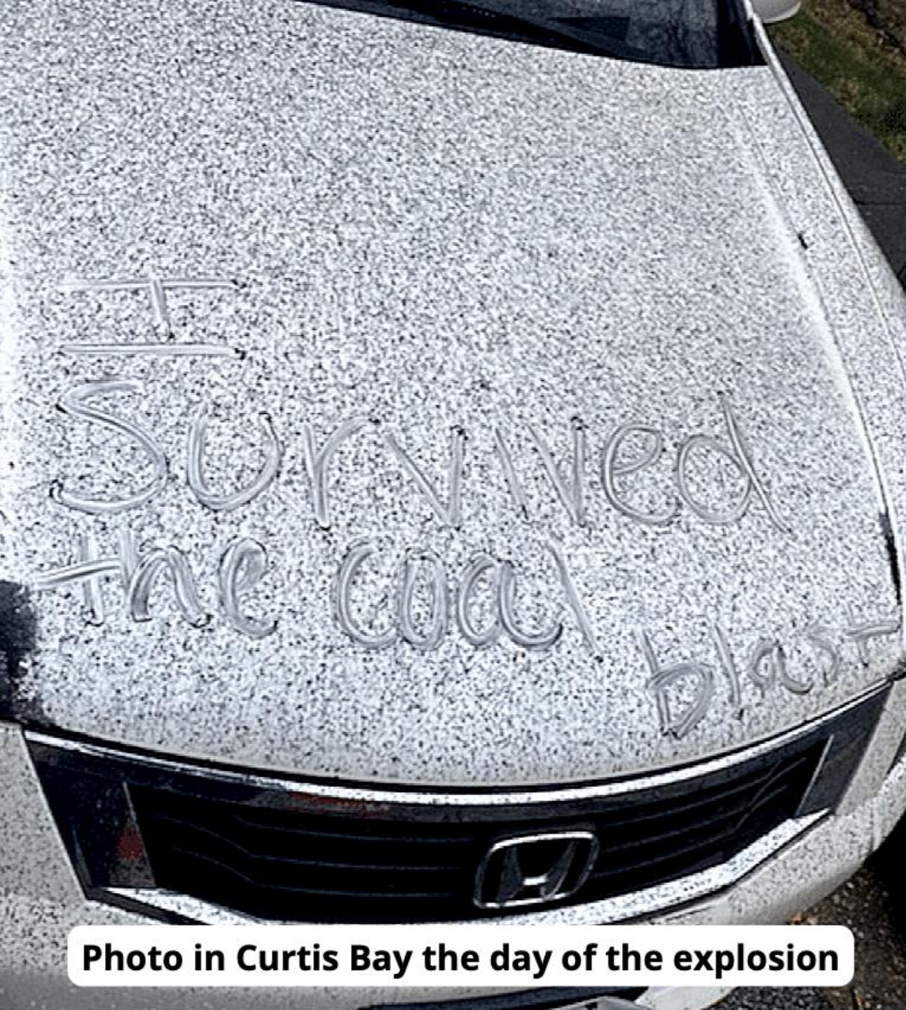
Photo in Curtis Bay the day of the explosion

Look at the people in West Virginia that died from black lung, from coal dust. So you bring it here in the city, in Curtis Bay and you spread it all around? -Curtis Bay Resident