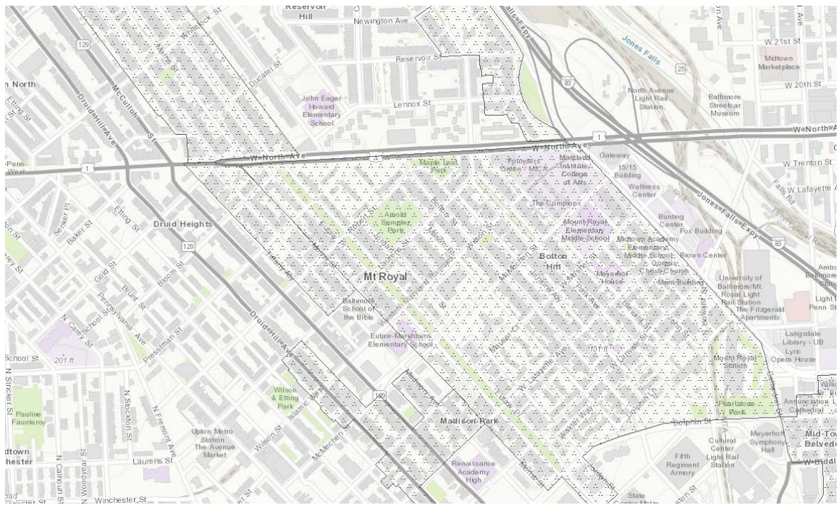
Baltimore City Historic Districts in area