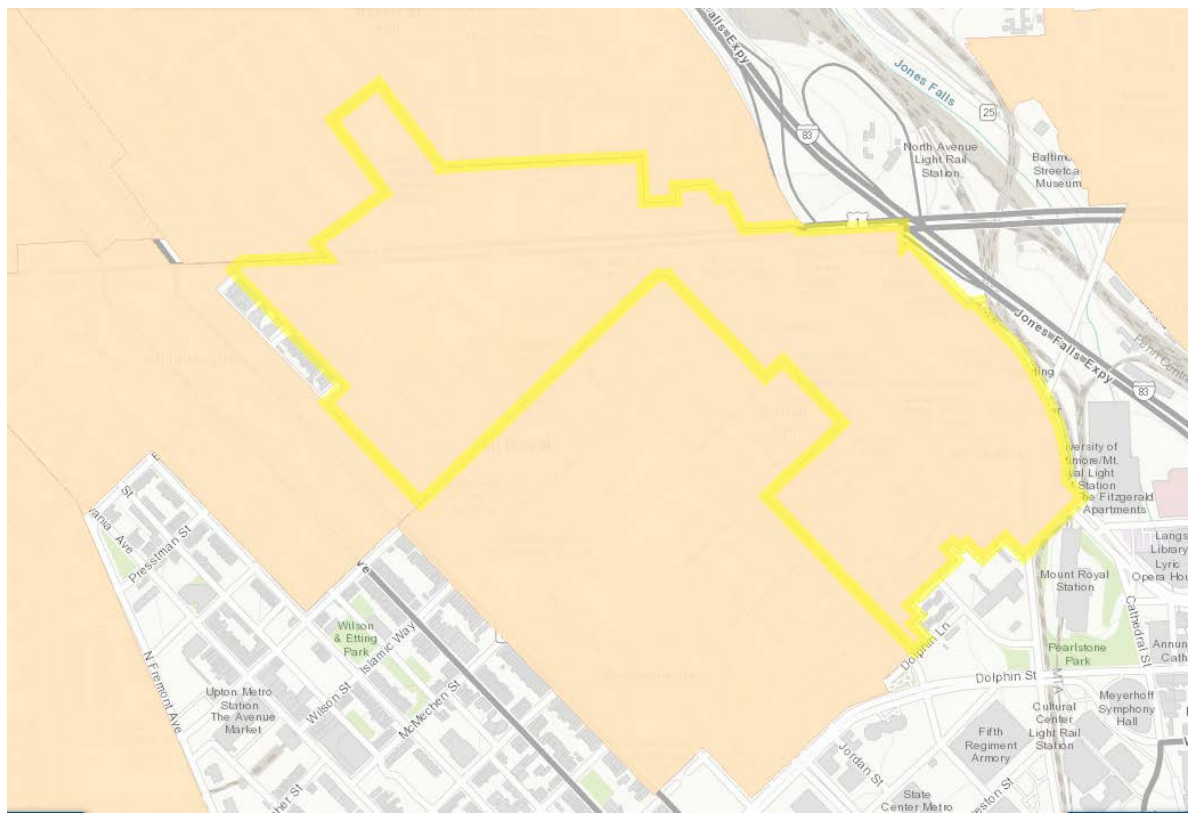
Madison Park North Urban Renewal Plan Boundaries (Yellow)