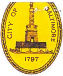
Catherine Pugh Mayor