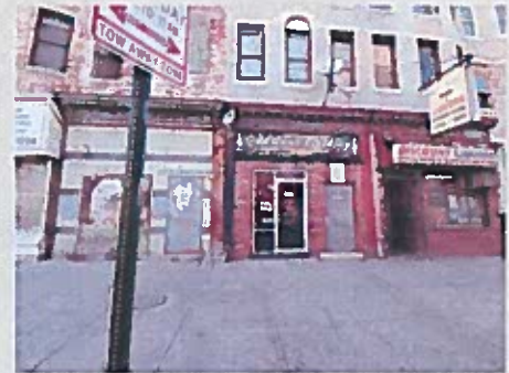
1200 W North