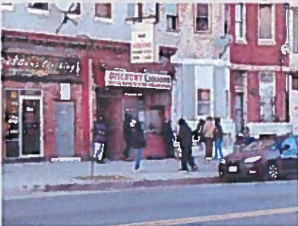
1200 W North