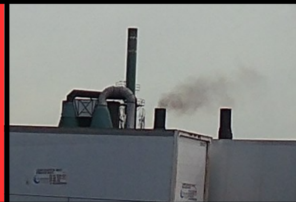
March 17, 2024