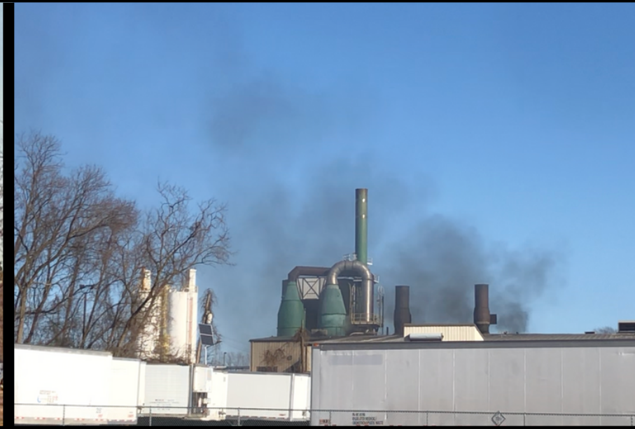
Feb 26, 2024