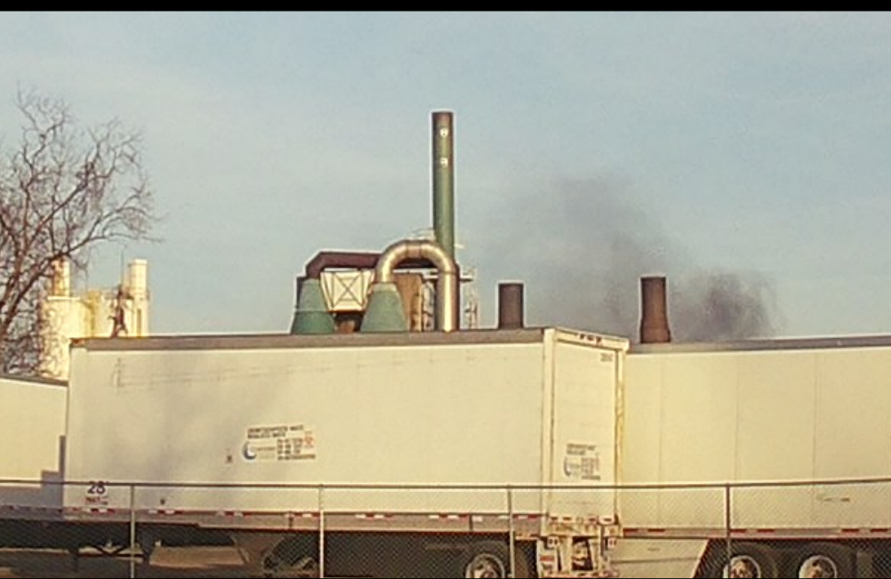
March 12, 2024