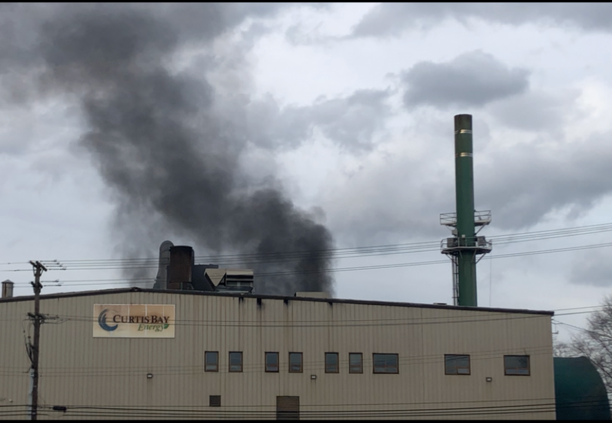
Jan 26, 2024