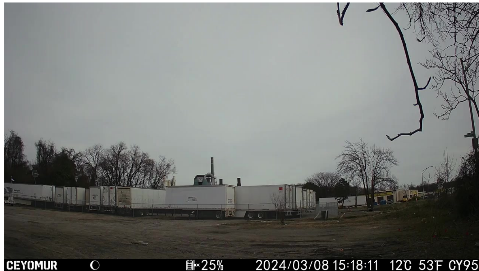
Dark smoke event from trail camera on March 8, 2024

Analyzed daytime trail camera images February 21- March 13, 2024 ~250 hours of footage