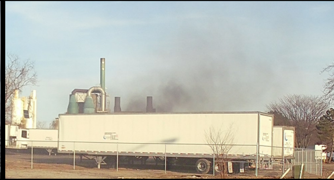
Feb 21, 2024