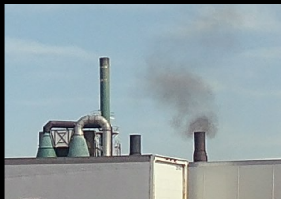
March 13, 2024

The State of Maryland files new lawsuit against medical waste incinerator 9