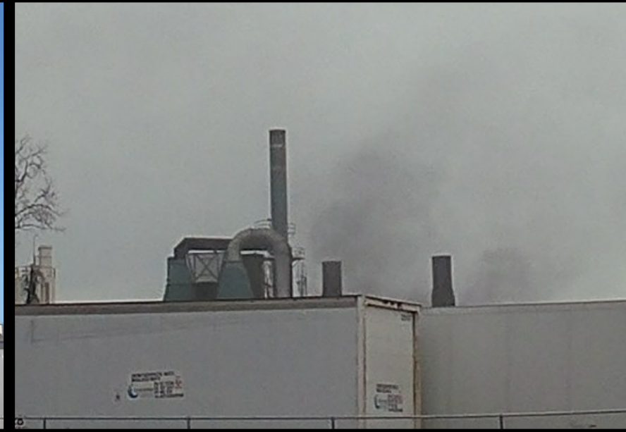
March 8, 2024