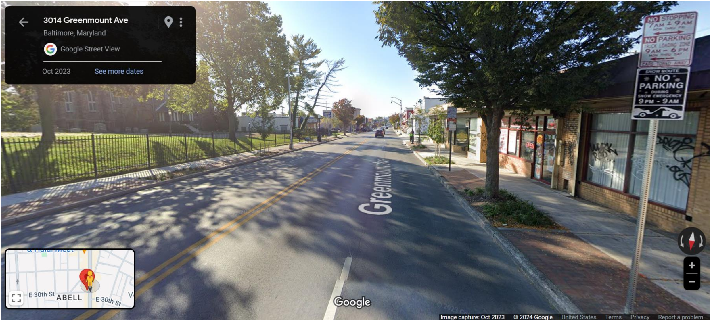
Image capture: Oct 2023 United States Terms Privacy Report a problem