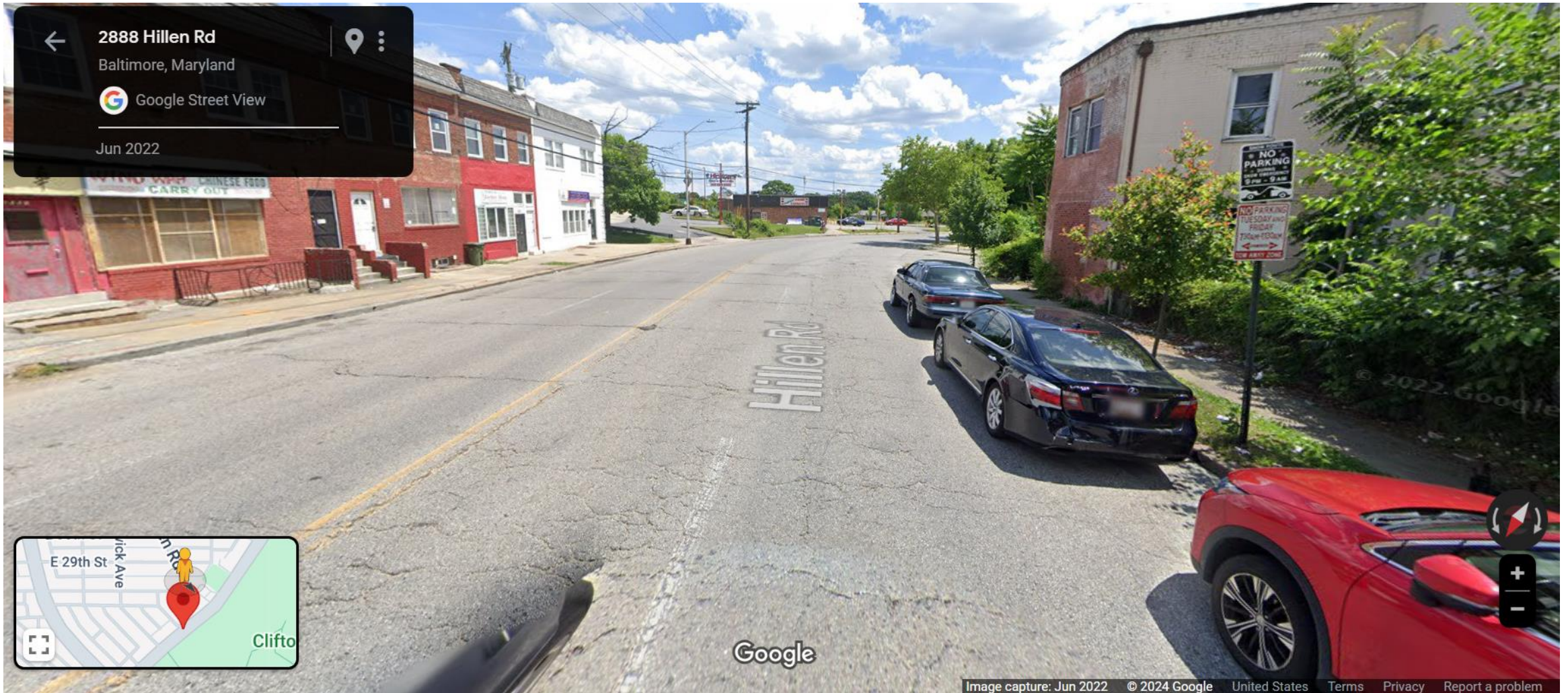
Image capture: Jun 2022 United States Terms Privacy Report a problem