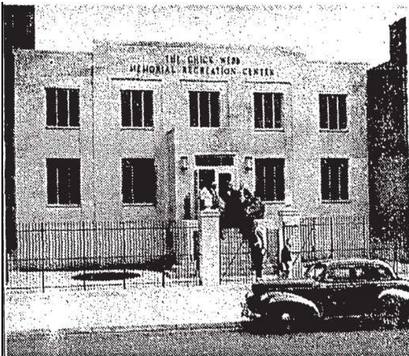
DRUMMER'S MEMORIAL —City officials pay a visit to the Chick Webb Memorial Recreation Center, developed by the city to honor the memory of the late Negro musician. Located in Eden street, the center will be accepted officially by the city on Friday.