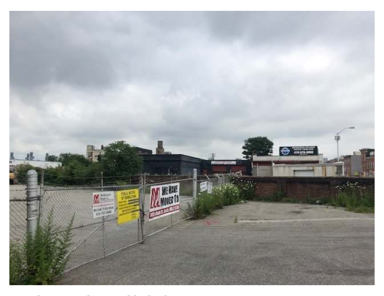
Warehouse on the 1800 block of S. Hanover St.