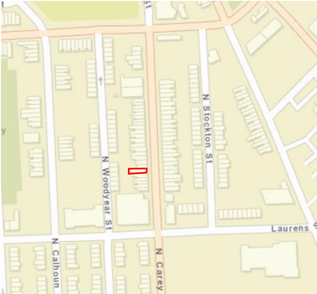
Map 2: Detailed map of 1316 N. Carey Street, marked in red.