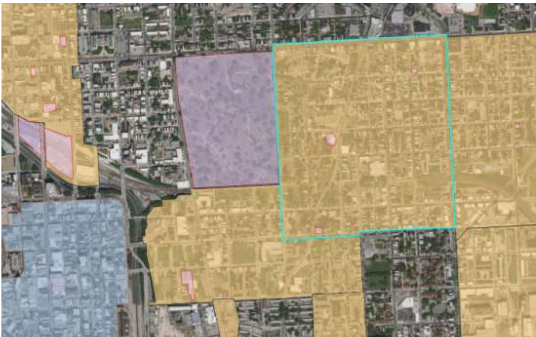
Aerial Map with Urban Renewal Plan Boundaries (Orange) including the Oliver Urban Renewal Plan Area (Orange with teal outline), Historic Landmarks (Purple with red outline), and Baltimore City Historic Districts (Blue with red outline)