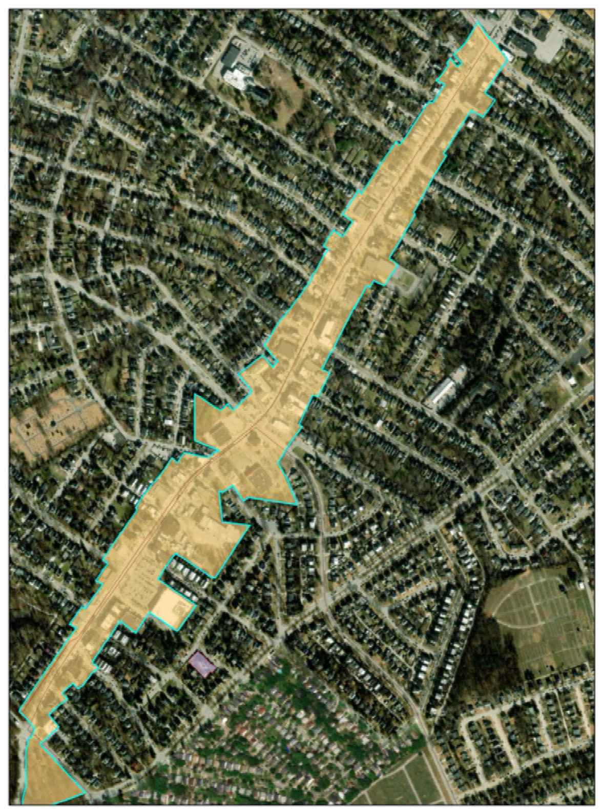
Aerial view of the Key Highway Urban Renewal Plan Area (Orange), Historic Landmarks (Purple with red outline), and National Register Historic Districts (Red Outline)