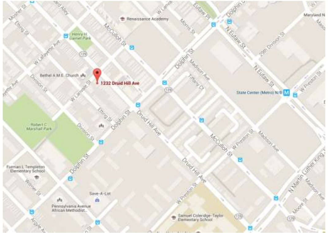
Map 1: Google map of the property.