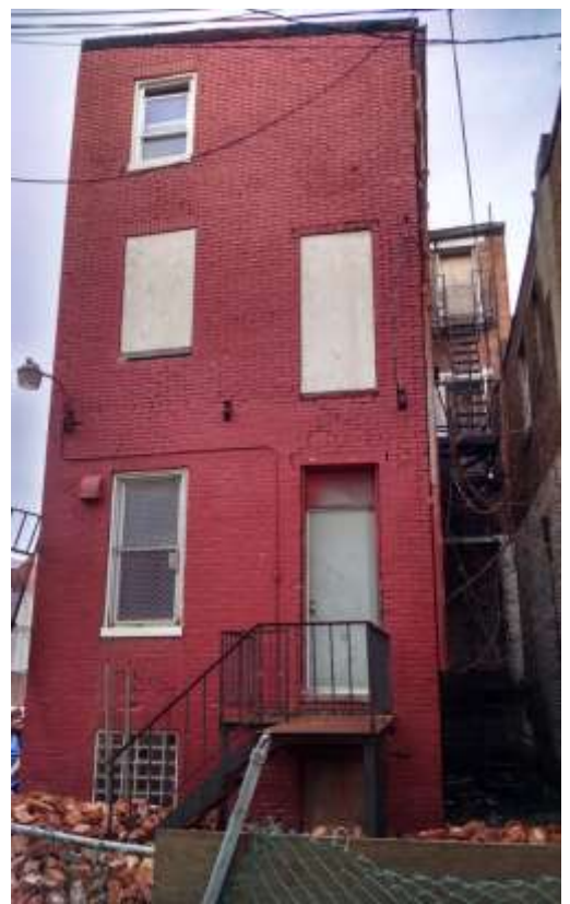
Image 4 – Rear (east elevation) of property. Photo taken December 2015.