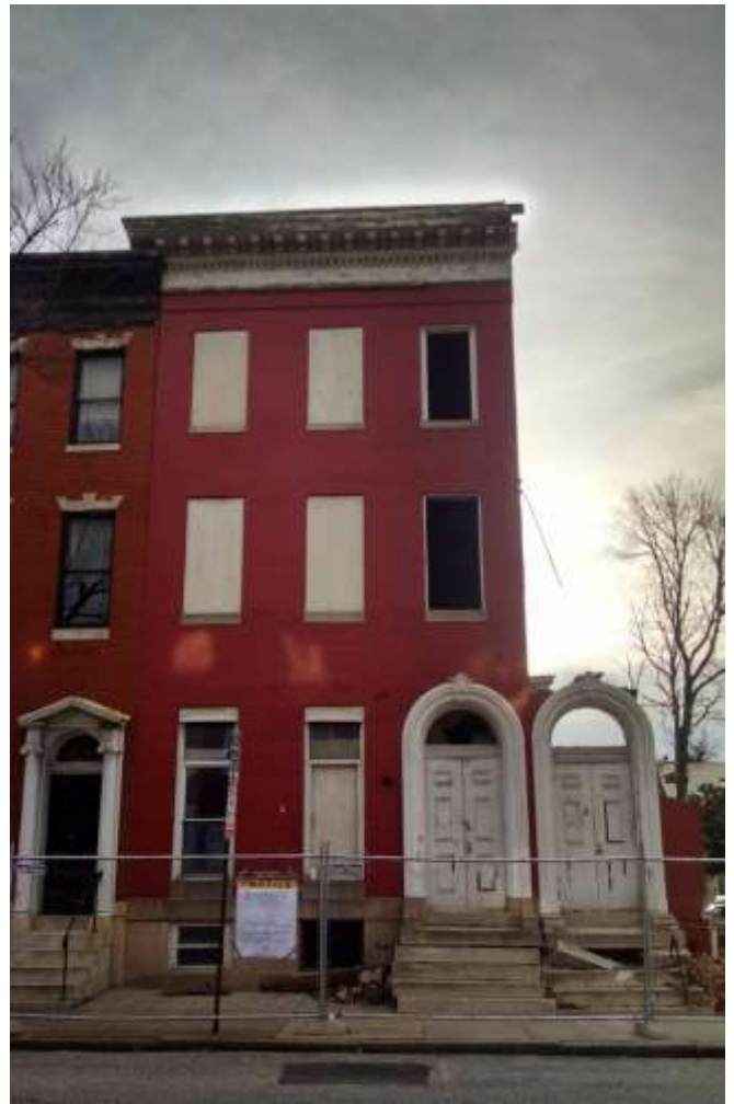
Image 2 – Façade of the property, facing west. Photo taken December 2015.