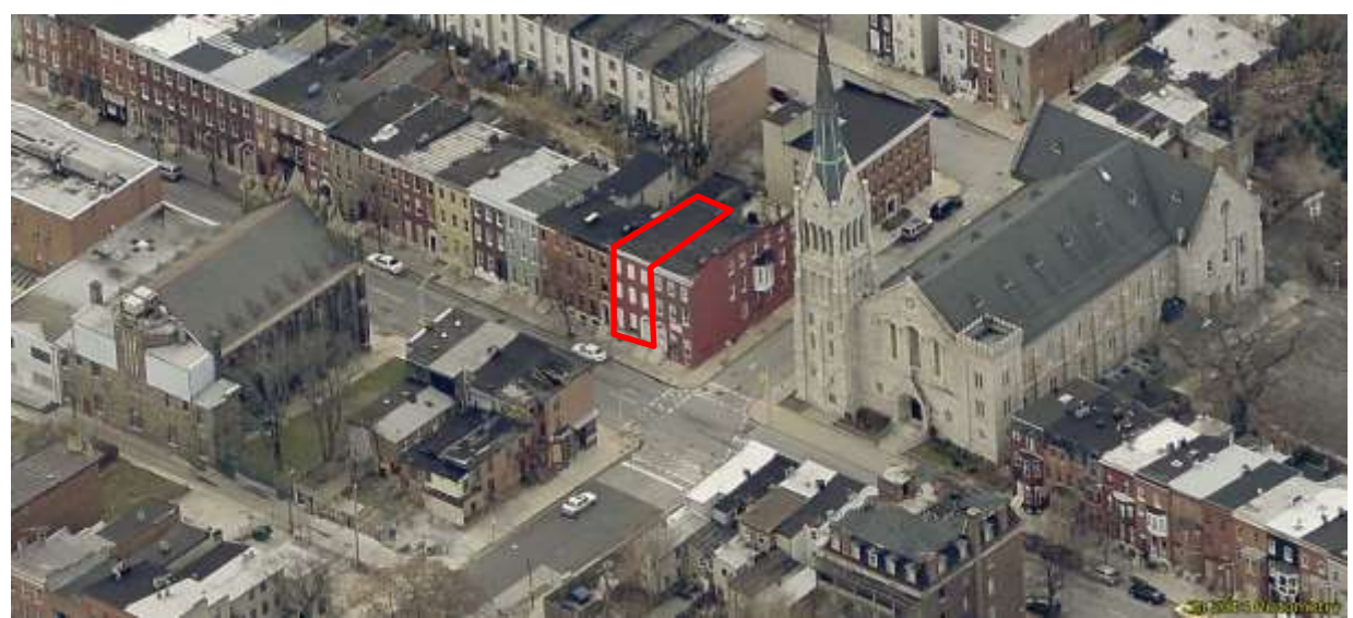
Image 1- Aerial view of site, looking south. The building is outlined in red.