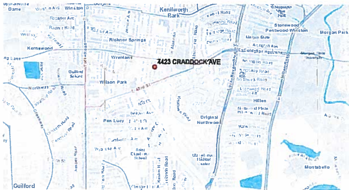
Map 1: Map of the property.