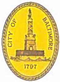
Catherine Pugh Mayor