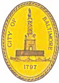
Catherine Pugh Mayor