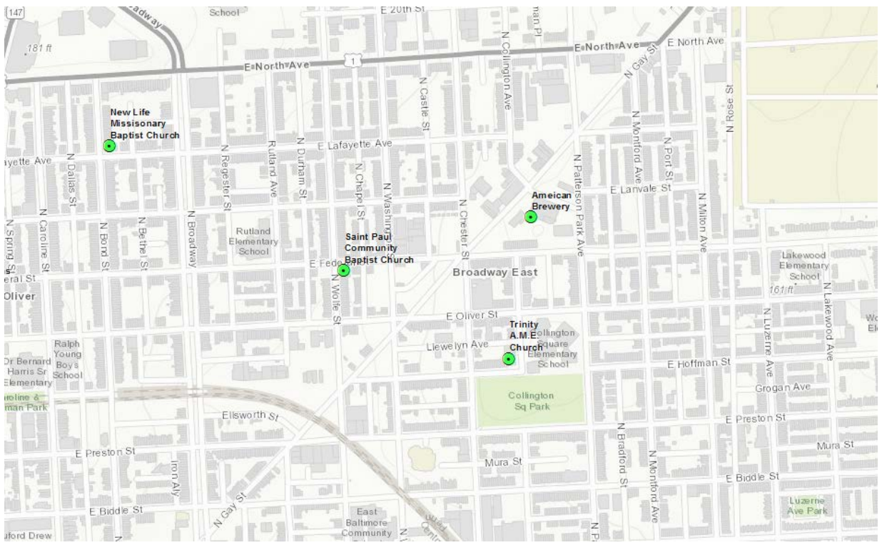
Baltimore City Landmarks in area