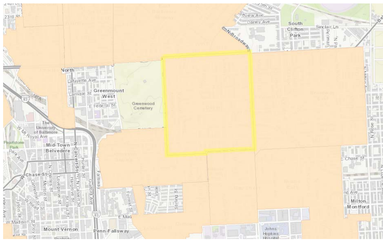
Urban Renewal Plan Boundaries (yellow outline)