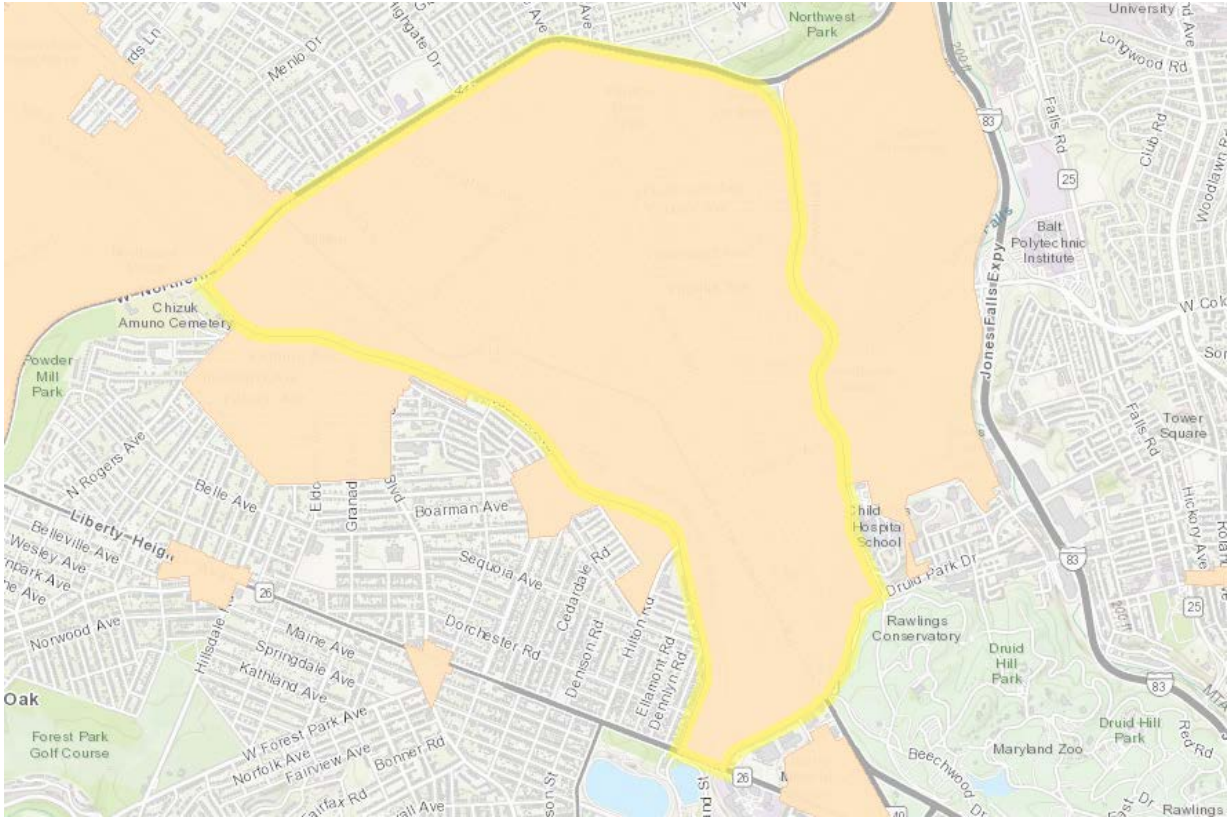
Urban Renewal Plan Boundaries (yellow outline)