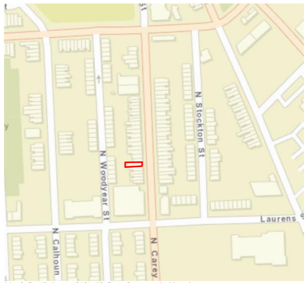
Map 2: Detailed map of 1316 N. Carey Street, marked in red.