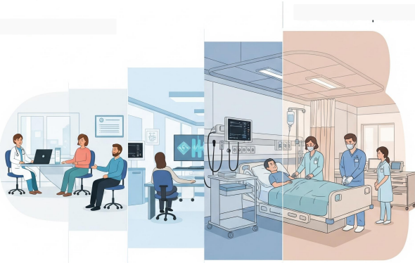
Outpatient (OP) Intensive OP Inpatient Hospitalization

Mismatches in care can drive patients to avoid treatment